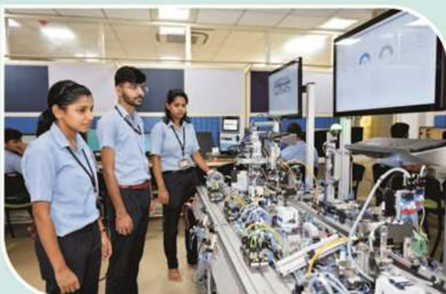
INDUSTRY 4.0 LAB